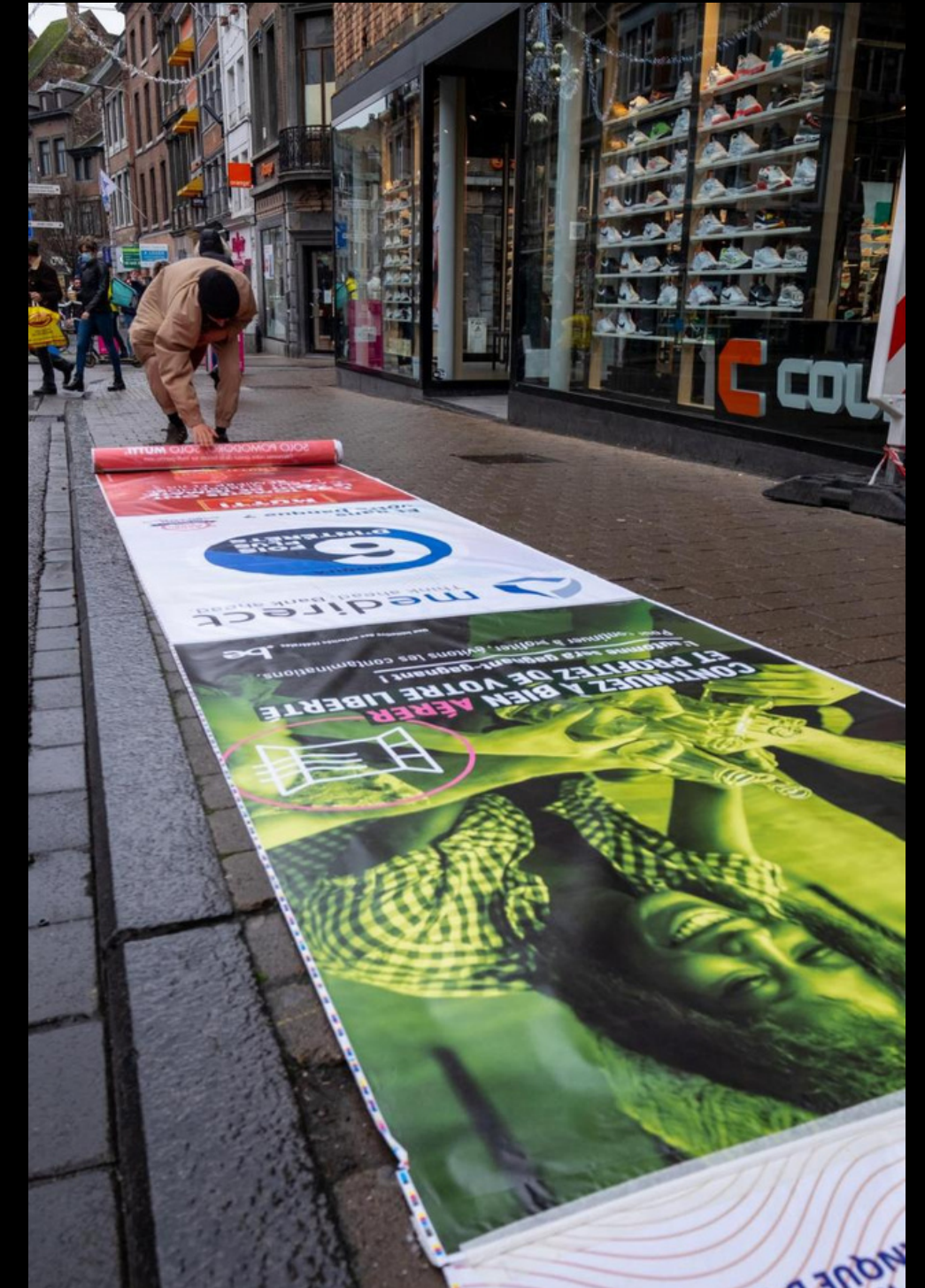
Photo: advertising posters taped together to create a 400 metre walkway