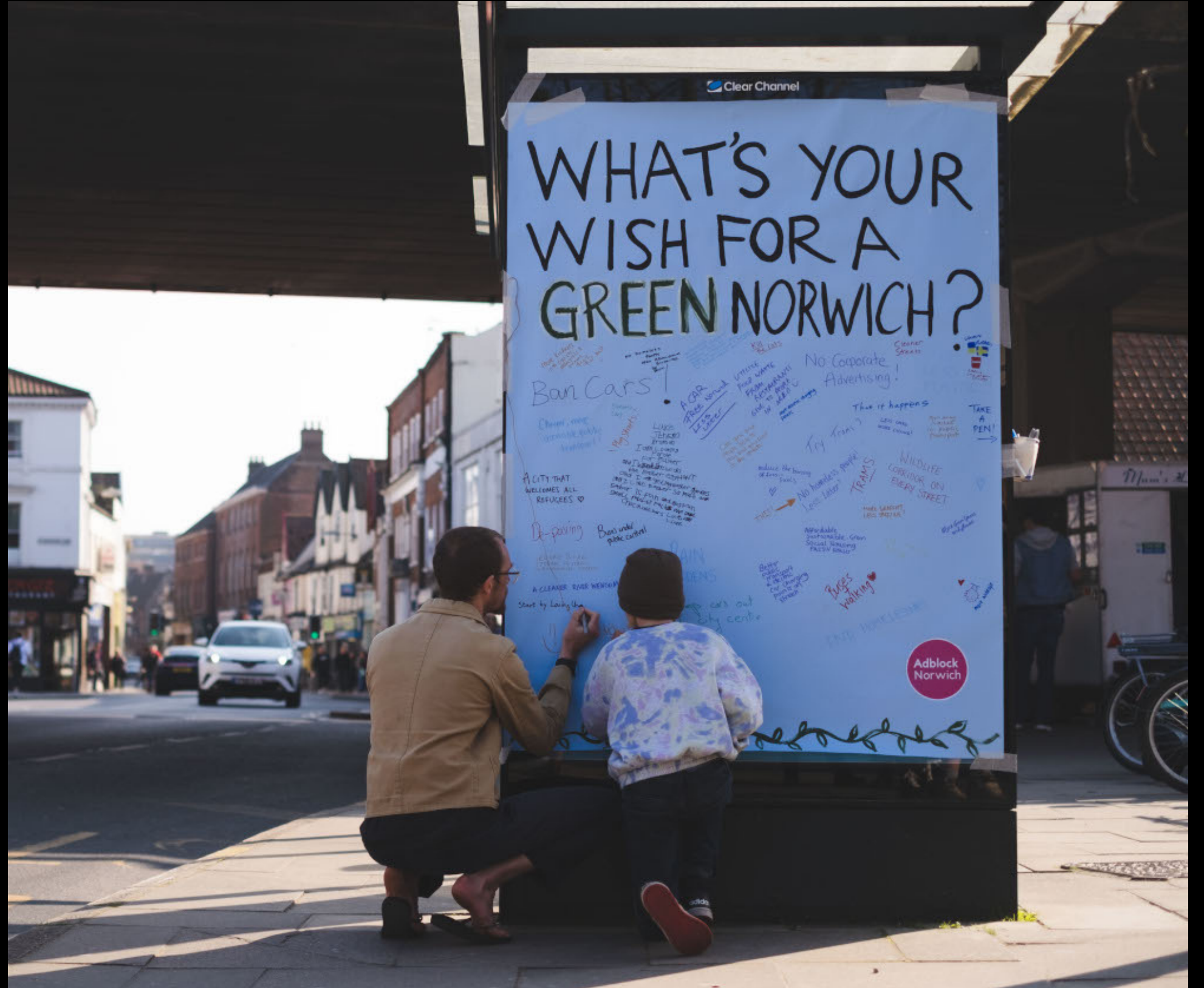
Photo: a temporary cover up of an advertising site in Norwich, England, 2022