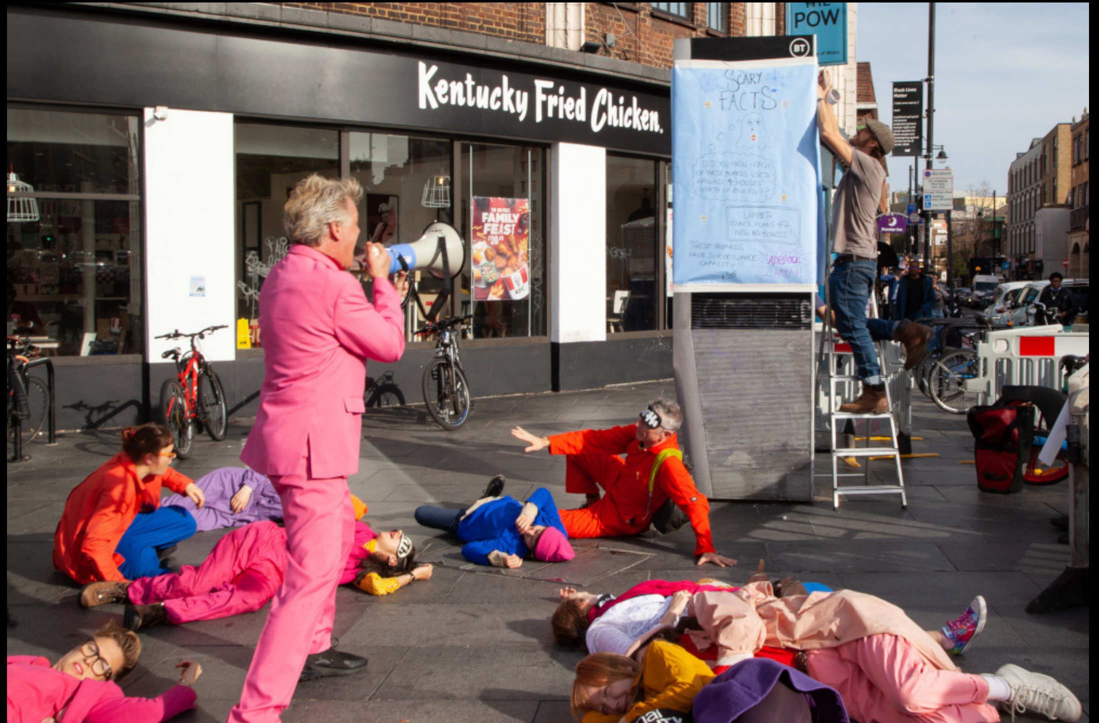
Photo: Reveremd Billy of the 'Church of Stop Shopping' performs an exorcism on a digital advertising screen in Brixton, South London. October 2023

Remember to photograph your action and submit it at www.subvertisers-international.net/ZAPGames